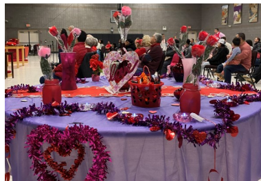
PHOTO HIGHLIGHTS FROM DIA DEL AMOR Y LA AMISTAD/ DAY OF LOVE AND FRIENDSHIP.

Visit www.standrewsumc.com for the link to sign up for the Metro District Lenten Devotionals.