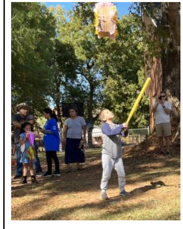
PHOTO HIGHLIGHTS FROM SATURDAY, OCTOBER 28<sup>™</sup>, LATINO HERITAGE FESTIVAL.

Empty plastic milk jugs Cotton Balls Brown paper grocery store bags 4 oz water bottles Paper Towels