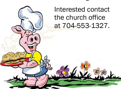
PHOTO HIGHLIGHTS FROM SUNDAY, OCTOBER 22<sup>ND</sup>, ANNUAL BBQ FUNDRAISER.