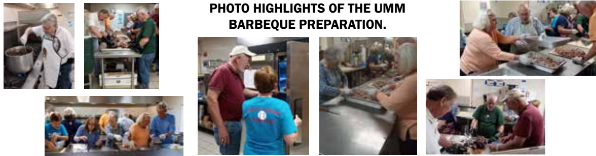
PHOTO HIGHLIGHTS OF THE UMM BARBEQUE PREPARATION.

GOOD FOOD STILL AVAILABLE. 1 pound packs of Pork BBQ - $13 4 pound packs of Pork BBQ - $40 Gallon Chili - $20 Purchase in the church office by check or pay by text to 833-718-0142.