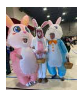
Spring Family Festival from Saturday, March 30th.