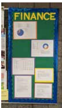
Family Life Center Bulletin Board.

St. Andrew's remains "mask optional." With the recent uptick in COVID cases, we encourage everyone to remember best care practices - social distancing is encouraged, masks are suggested especially if you consider yourself in the vulnerable health category, and frequent hand washing and use of sanitizer is recommended.