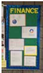
Family Life Center Bulletin Board.