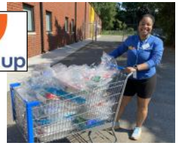
Nourish Up (Formerly Loaves & Fishes) Birthday Kits collection.