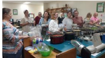
Montclaire Elementary School Teacher and Staff Appreciation Day luncheon on Wednesday, May 8 th .