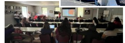
Sunday, June 2 nd , Conference for Hispanic Families with Different Abilities event.