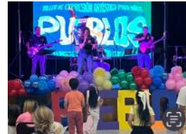
Sunday, June 2 nd , PUEBLOS bilingual story time.