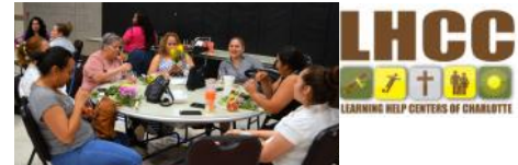
Sunday, May 26 th , Learning and Help Center of Charlotte honoring Mother's.