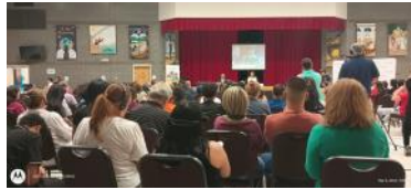
Charlotte Mecklenburg School Town Hall on Monday, May 6 th .