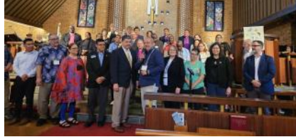
Attendees from the General Conference.