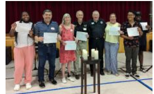
Swinging Saints Square Dance graduates.