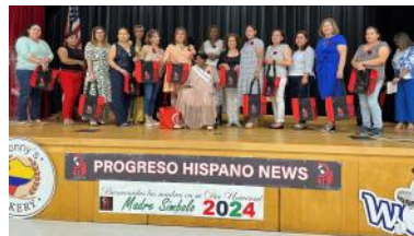
Sunday, May 12 th , Hispanic Mother's Day celebration.