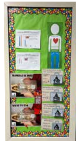
Financial Bulletin Board located in office hallway and Family Life Center.