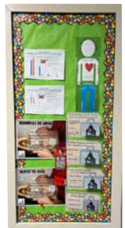
Financial Bulletin Board located in office hallway and Family Life Center.