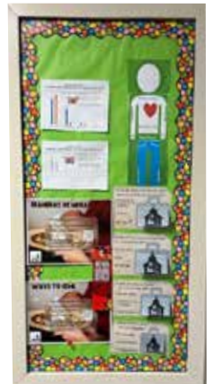
Financial Bulletin Board located in office hallway and Family Life Center.