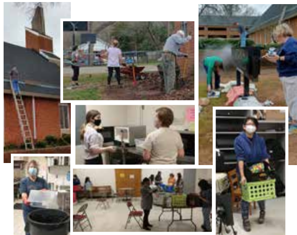
PHOTO HIGHLIGHTS FROM CHURCH WIDE CLEANUP ON SATURDAY, MARCH 13TH.

Thank you to all of our volunteers for their time and hard work in making St. Andrew's UMC look its best.