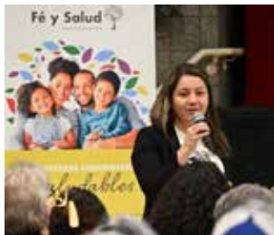
Mother's Day Celebration Sunday, May 12, 2024