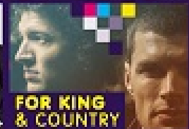
FOR KING & COUNTRY