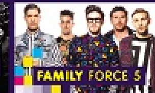
FAMILY FORCE 5