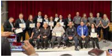
Chaplaincy Course Graduates

Cost for the meal is a donation from which net proceeds will support youth mission. Sign up online at https://tinyurl.com/YouthThanksgivingLuncheon22 Can't make the meal - donations are always welcome. Thanks for your support.