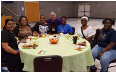
Breakfast for Montclair Teacher.